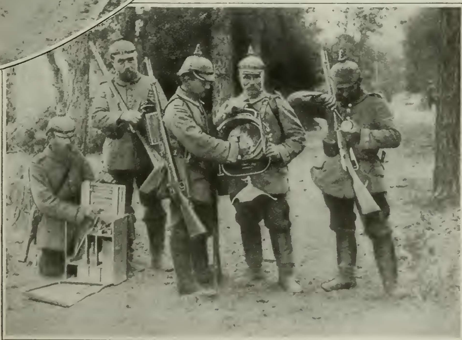
Another example of Germany's inventive genius turned to warlike purposes. The photograph shows the portable searchlight. This projector, small as it is, is remarkably powerful, and may be assembled for action in an exceedingly small space of time