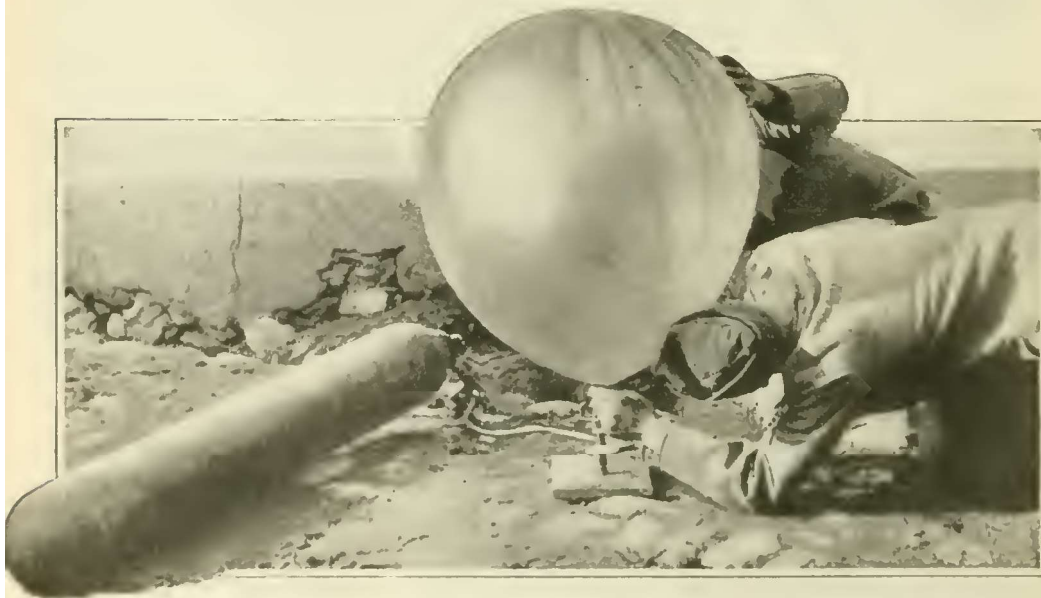
An Austrian pilot balloon being inflated from a gas cylinder. These small pilot balloons are sent aloft just before a Zeppelin foray in order to determine the direction and velocity of the air currents. In time of peace they are employed to obtain temperature readings of the upper air for the use of meteorologists