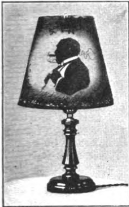
Parchment lamp used as cigar advertisement

P ARCHMENT lamp shades, which lately have achieved wide popularity in the home, are employed by an Indianapolis company as an advertising novelty.