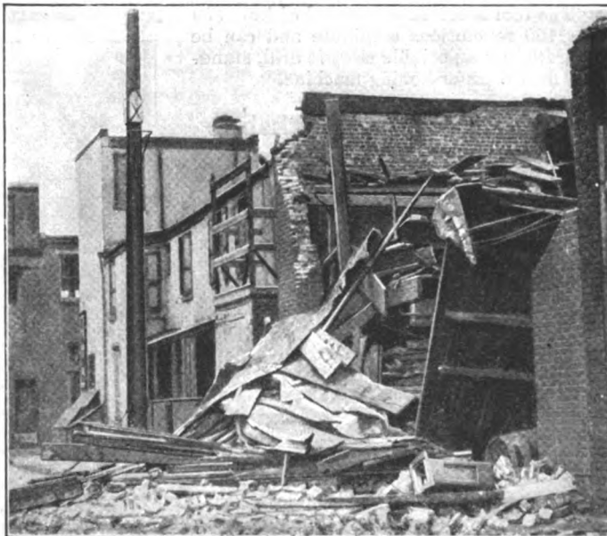
Building demolished by the weight of water on its roof

A slight storm added enough water to that already there to cause the beams and joists to give way.