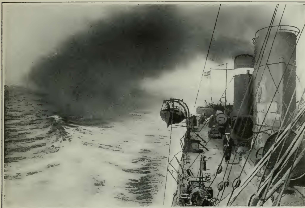
The British destroyer "Kennet" making a smoke screen to protect the Allied fleet from the fire of the Turkish batteries in the Dardanelles. Oil is poured on the fires and dense clouds pour forth to hide ships from the enemy. The ruse is used by all navies