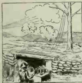
Wireless Telegraphy—It Often Proved the Only Reliable Communication in Battle.

A s a fitting conclusion to this series of articles, let us consider to what extent Physics helped to beat the Huns. The bulk of the wonderful work done by all branches of science has as yet not been disclosed to the general public; but the following material disclosed by Professor Ames, of Johns Hopkins University, in his address at the University of Virginia, by Dr. Hale in his address before the New York Engineering Societies, by Professor Millikan, of the University of Chicago, in his address at the Philadelphia meeting of the American Institute of Electrical Engineers, and by Major-General Squier in his address at the New York meeting of the A. I. E. E., is more than sufficient to make it evident to us that Science in general and Physics in particular, deserves a lion's share of the glory accruing from the victory of the Allies.