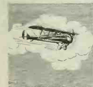
Giant Bombing Planes Were Threatening to Wipe Out Berlin When the Armistice Was Signed.