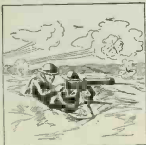
Machine Guns—Another Weapon of Science, Worked Havoc to Both Sides Night and Day.

Others proposed magnets of various forms, which on trailing along beneath an airplane would drag up any submerged invisible submarine. Another proposed generating a wind so strong that it would push away any approaching airplane, balloon, etc. Thus airplane raids were eliminated, submarine attacks were ended, and the war was over. These fool inventions were coming in so fast that the Board in self-defence determined not to consider any inventions sent in by these wonder-workers unless a "working model" accompanied the papers. It was evident that the road to a successful termination of the war lay in bringing together men possessing scientific knowledge, and equipt with scientific methods. In ordinary peace times the college professor is at a disadvantage—he is usually ignorant of, or not interested in commercial development, and does