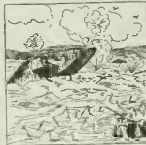
Tanks by the Thousand Frequently Turned the Tide of Battle for the Allies.