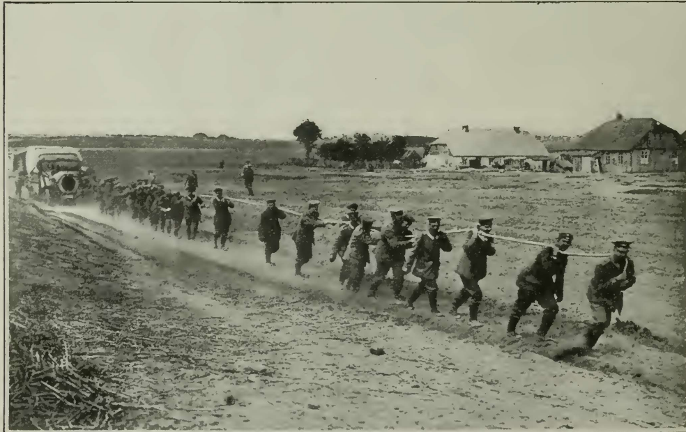
Military trucks are sometimes mired in the swamps and mud holes near the front, especially on the Russian battlegrounds. Here is a German ammunition truck being pulled through a Polish swamp by a large force of soldiers