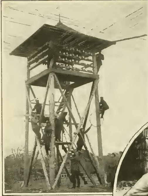
At left, Germans establishing a great army telephone exchange somewhere along the southeast Russian front. Below, oil-can, lantern and measuring cup—part of a German officer's outfit