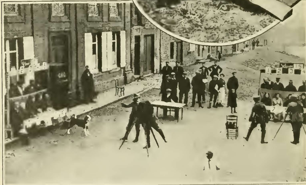
In Russian Poland, the German officers keep an accurate record of every peasant by means of his photograph. Ten pictures are taken at one sitting and then cut apart with their respective numbers. These are then filed with the military governor