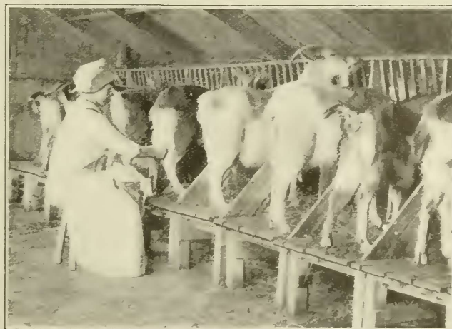
Contrary to popular belief, the goat is a tractable animal, easily tended by a woman or even by a child

She is the healthiest domestic animal in the world. She is non-tubercular and gives pure milk, of rich quality and fine flavor. She can be kept in much smaller quarters than a cow requires.