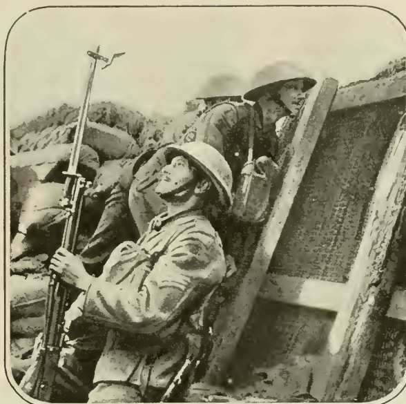
By attaching an ordinary trench mirror to the end of his bayonet blade the Tommy has a makeshift periscope

S TUDY the accompanying illustration and you will see what a British Tommy can do with his bayonet, by exercising some cleverness and ingenuity. At the point of the blade is affixed an ordinary trench mirror. By leaning back against the parapet the Tommy can see the outskirts of No-Man's Land and the enemy's trenches in his makeshift periscope. Beside him are two observers.