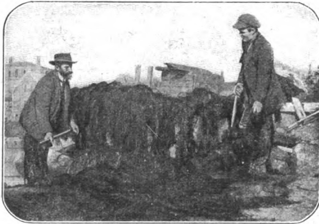
With meat soaring to prices that only a Rockefeller can pay, who knows but we may be eating seaweed soon?