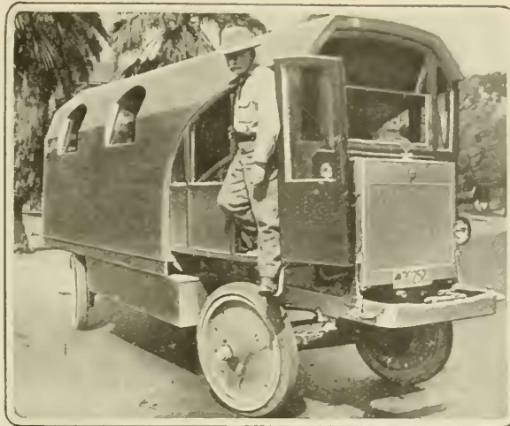
A nature lover had the body of this automobile fashioned out of a hollowed redwood log

The modern soldier carries more than twenty implements of warfare in addition to his gun and blanket. Is it any wonder he has to be strong?