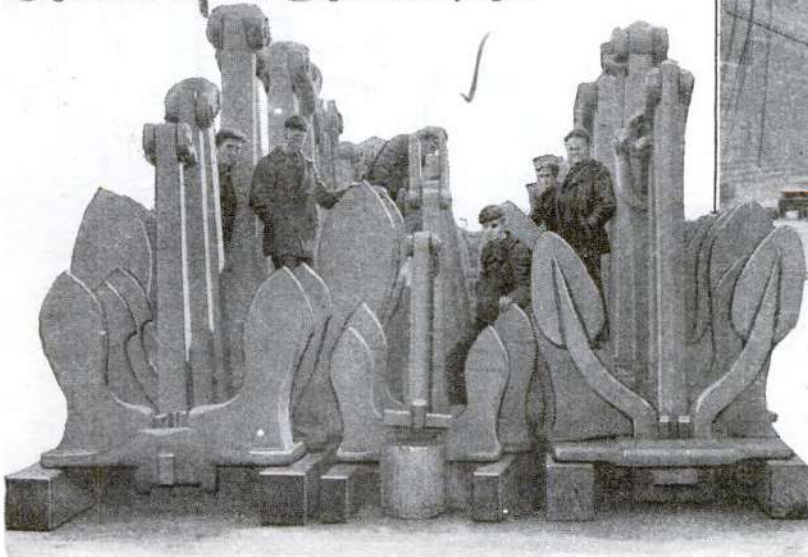
Marked with number, height, and weight, the anchors form a unique filing system

Each anchor has a number, and its height, weight, and type are kept on file in the office of the Navy Yard. The name of the vessel to which the anchor belonged also is listed carefully. The small anchor in the center of the photograph weighs 1000 pounds. From this the weight of the giant anchors surrounding it can be judged.